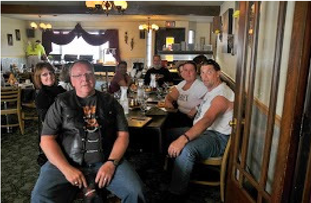
HOG Chapter ride 2013