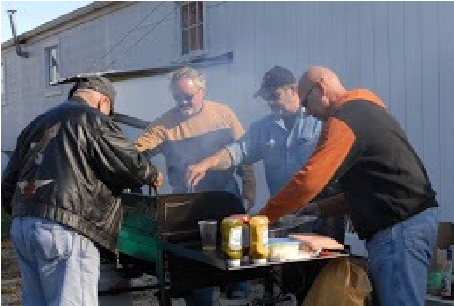
Rustic Road Ride 2012 Pic's