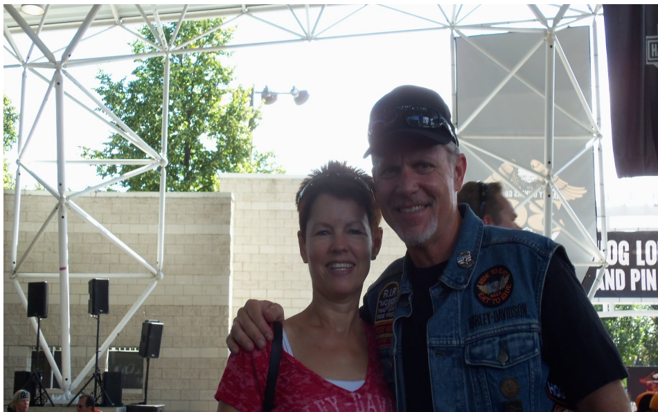
Family at the 110th—smiling!