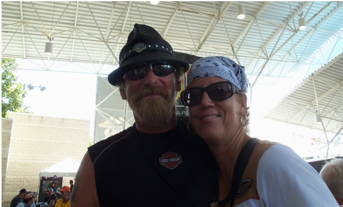
Family at the 110th family reunion!