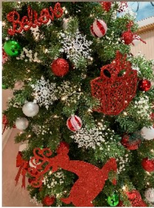
KENOSHA HOG Christmas Tree at Manor Care